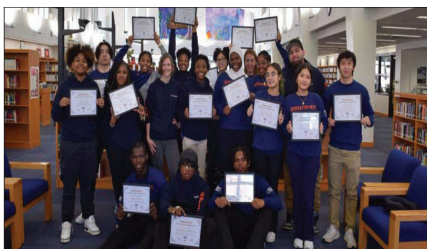
Nineteen PM West HS seniors participated in the Generation Next program, which helps prepare students for college and the transition from high school to college.

field. Using information gained from their training sessions and field experience, students were required to complete a formal presentation at the end of the experience that summarized their gained knowledge to their teachers, hospital, and district administration.