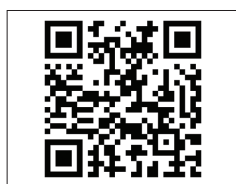
QR Code to the "Seize the Spotlight" Chicago Trip Video