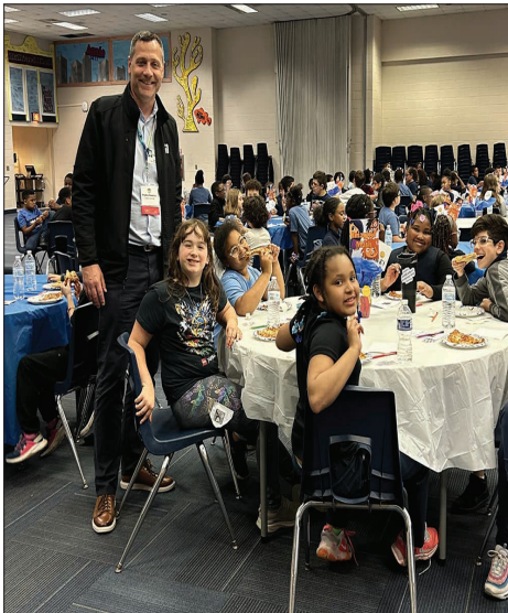
Clear Run Intermediate School students earned an end-of-year celebration for excelling at Imagine Math lessons.