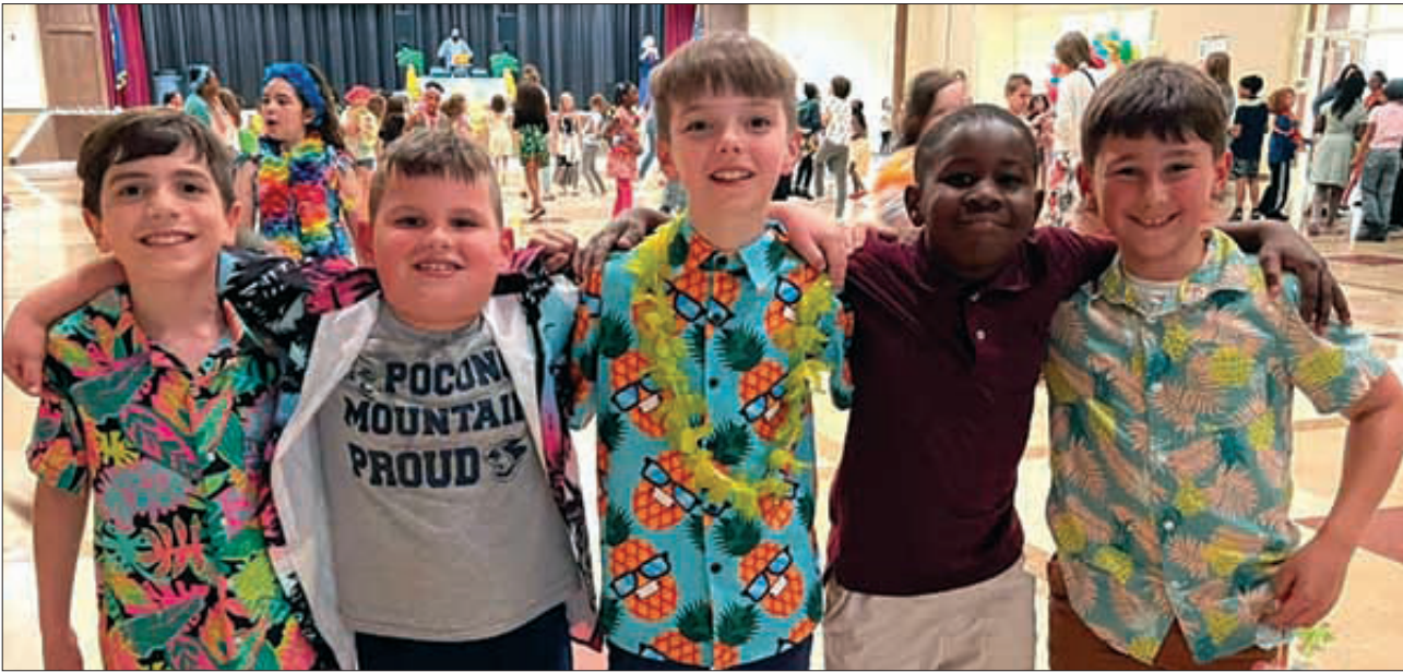
(Above) Swiftwater Elementary Center (SEC) held a luau for it's 3rd graders to celebrate their moving up to the Swiftwater Intermediate School (SIS) for 4th grade. (Below) SIS students help out at the SEC Field Day.

Student art work was displayed to show appreciation