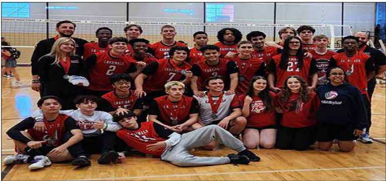
The Pocono Mountain East Boys Varsity Volleyball team brought home Silver from the District XI 2A championships.

The team earned a spot in the Regional Championships at Daniel Boone High School. Congratulations