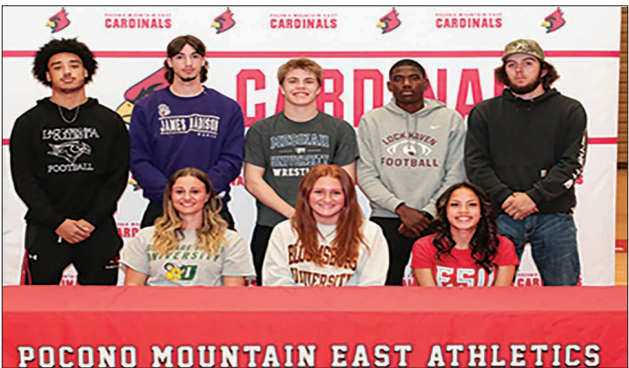
Ten Cardinal senior athletes signed on to play sports at the collegiate level.

Ten East High School student athletes celebrated their commitment to continue playing at the collegiate