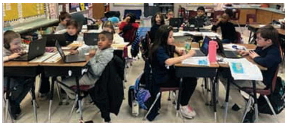
Clear Run Elementary Center students publish a book during the 2023-24 school year.

their writing skills but also introduced them to the exciting world of digital publishing.