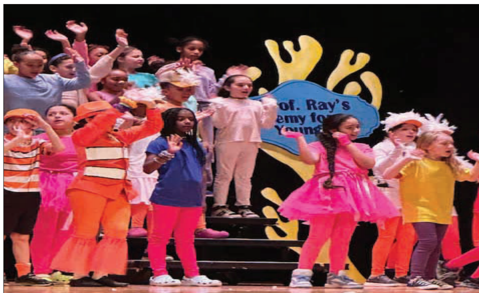
Clear Run Intermediate School's Drama Club students took to the stage in Spring to perform Finding Nemo before packed audiences.

year, students are already excited for the opportunity to participate in another musical at the intermediate level. Auditions and information for the next musical will be available to students and families at CRIS in the beginning of the next school year.