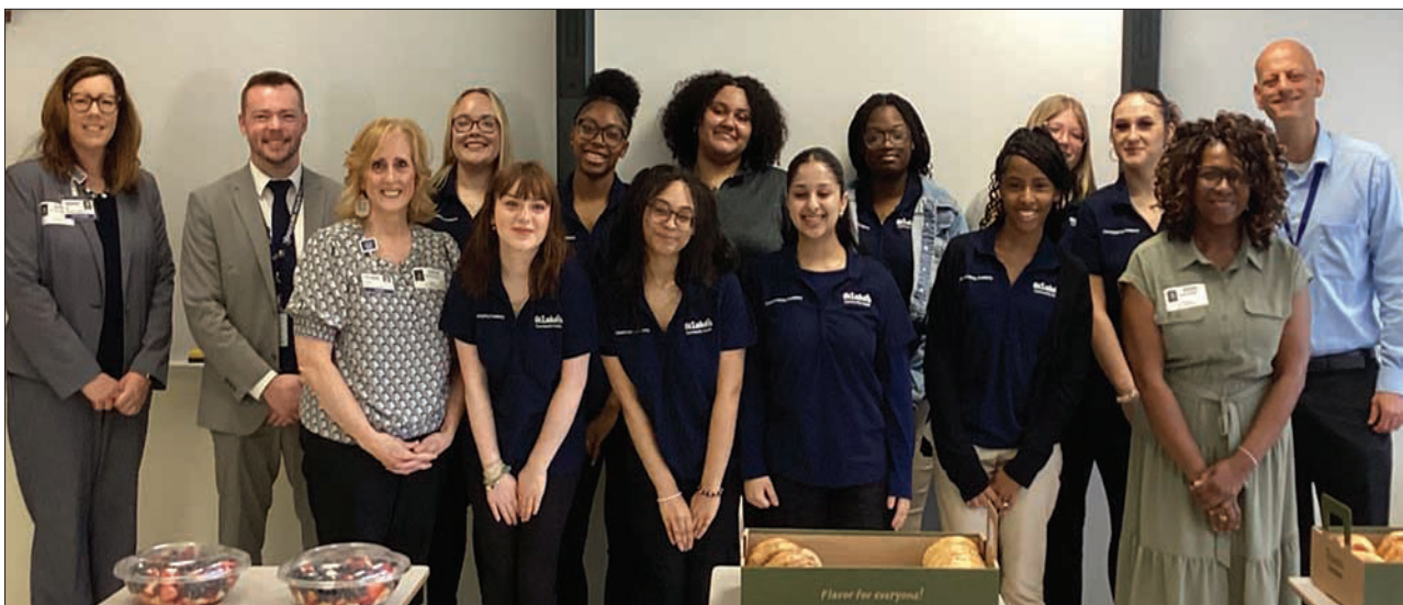
The St. Luke's Careerlinking Academy is a great program available to Pocono Mountain West High School Juniors, created through a partnership with St. Luke's University Health Network. Students accepted into the program are able to learn about clinical and non-clinical health care-related jobs.

Students are also provided an opportunity to shadow staff in different fields as they complete their hospital rotations. Students this year were able to work with nurses, radiologists, and technicians in the