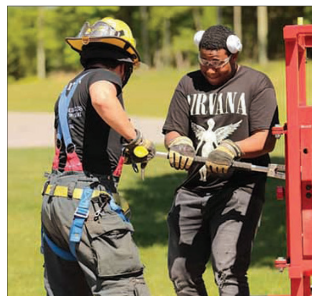
The PM West HS Safety Carnival demonstrates the strong partnerships between the high school and local emergency responders. Students learned more about the role of emergency responders through hands-on activities, such as prying open a door using firefighting equipment and tools.

All of these experiences are great learning opportunities for students and exist because of the dedication of staff and the support of our community. The West High School looks forward to continuing these relationships and creating a diverse network of experiences for its students.