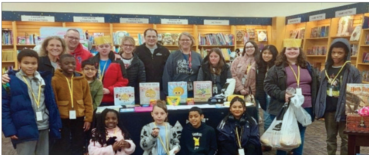
PMSD Cyber students attended a field trip at Books-A-Million in Dickson city for the annual, Read Across America celebration. Students received swag bags courtesy of Books-A-Million.

Any student who is enrolled in the Pocono Mountain School District and is interested in competing in college sports will be able to select and participate in PMSD Cyber Program core courses from the list of requirements in the NCAA Eligibility Center. In