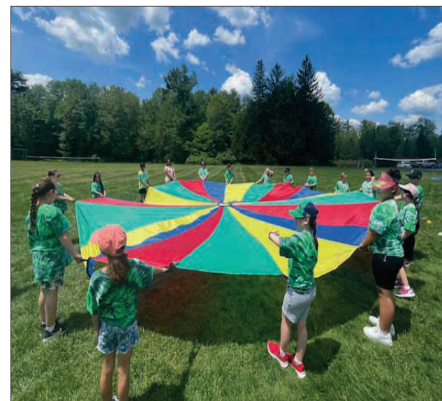
Students at Tobyhanna Elementary Center enjoyed the activities during their annual Field Day event.

A quality education, just like traditions, provides students with fond memories and something they can relate to. Over many years, numerous traditions have been woven into the fabric of the TEC experience. They are anticipated by our incoming students and remembered by our graduates. Our teachers find great fulfillment as they perpetuate our numerous traditions and it's very obvious our parents appreciate those