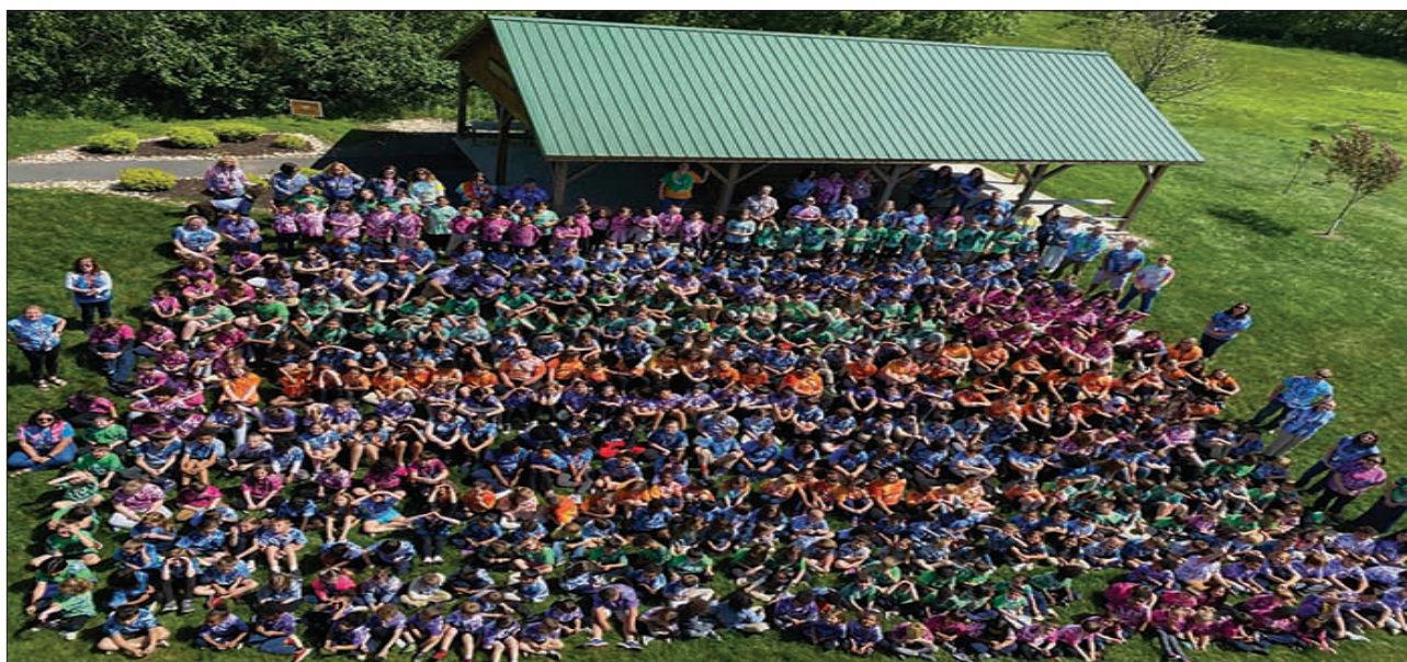
What better way to show school spirit than through Tie-Dye Day, when the entire student body assembled in their tie-dyed shirts for a school photo.

Throughout the morning's joy and excitement, there was a common thread among all the positive comments and conversations. Every senior remembered the numerous traditions that they enjoyed as an elementary student several years ago.