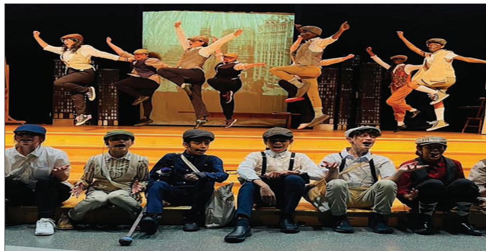
Pocono Mountain West Junior High School students showcased their amazing talents during their production of the musical, Newsies Jr.